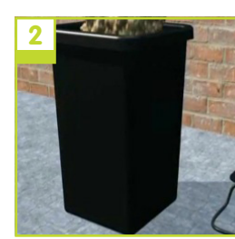
Fill pot with medium and pot up plants.

Water through pot and allow to drain outside the tray.